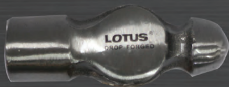
Ball Pein Type