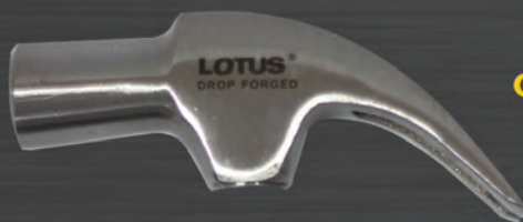
Curve Claw Type